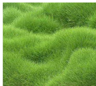
Figure 5. Cynodon dactylon (Durva). [29]

The plant leaves are locally available and are used for making natural antibacterial bandage. In the current research a comparative analysis had been done for selecting best antibacterial agents for making antibacterial bandage.