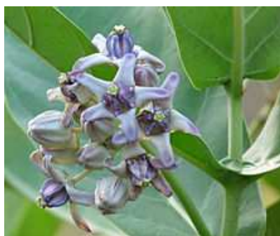
Figure 1. Calotropis gigantea (Aakada). [25]

So, there is a huge gap between traditional knowledge and modern science. To reduce this difference a little bit, five well known plants has been selected for this study. The selected five plants are Aakada ( Calotropis gigantean ) shown in figure 1, Guava ( Psidium guajava linn ) shown in figure 2, Marigold ( Calendula officinalis ) shown in figure 3, Parijat or Night jasmine ( Nyctanthes arbor-tristis ) shown in figure 4, Durva ( Cynodon dactylon ) shown in figure 5.