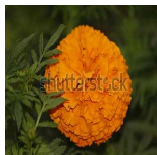
Figure 3. Calendula officinalis (Marigold). [27]