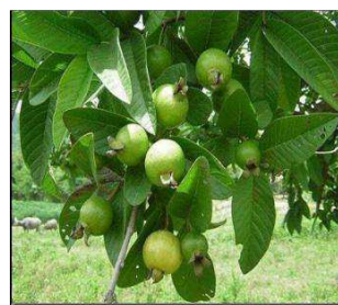
Figure 2. Psidium guajava linn (Guava). [26]