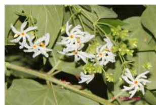
Figure 4. Nyctanthes arbor-tristis (Parijat). [28]